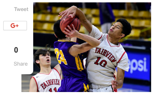
Read the latest high school sports stories from The Denver Post beat writers. Read more »